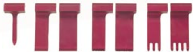
Hook and Blade Assortment